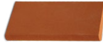
#6 I-Stone (Wedge) Medium Grit SS6