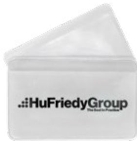
Magnifying Lens Credit Card Size LENS