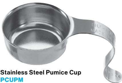
Stainless Steel Pumice Cup PCUPM