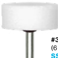
#304 HP Composition Stone (6 x 16mm) diameter SS304