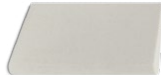
#6A Arkansas Stone (Wedge), Fine Grit SS6A