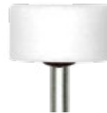
#303 HP Composition Stone (6 x 13mm) diameter SS303