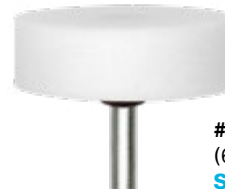
#305 HP Composition Stone (6 x 19mm) diameter SS305